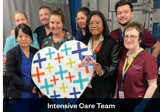
Intensive Care Team