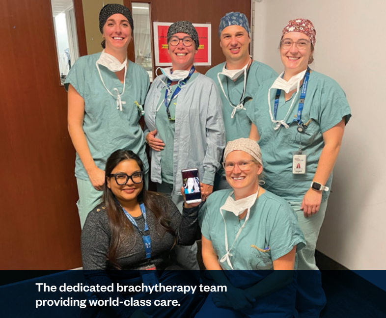
The dedicated brachytherapy team providing world-class care.